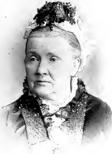
JULIA WARD HOWE.

Emerson." In 1872 she went to England to lecture on arbitration as a means for settling national and international disputes. In London she held a series of Sunday evening services, devoted to "The